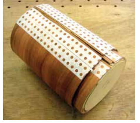
A typical lamination of drawer box and housing created on a single former

The two laminations are made from five layers of commercial veneer. The cylindrical former must be perfectly flat with parallel sides. Any tapering or waviness to the shape may make it difficult for the finished drawer to open and close. The former can be turned on a metal or wood lathe. After turning on a wood lathe you can glue coarse sandpaper to a straight piece of wood that is longer than the former and sand the sides flat. Measure each end of the cylinder to check the sides are parallel.