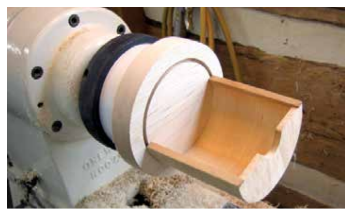
Test fitting the drawer in its groove in the drawer front while the drawer front is still on the lathe

fun on the lathe. Turn the drawer front to size and add a flourish to its face. The drawer front can also be dished out on the inside if you wish. The only mandatory requirement is to create a groove to hold the drawer front on the drawer. I use a vacuum clamping chuck on my lathe to hold the work, eliminating the hassle of working around screw holes or chuck fittings. Test fit the drawer on the cabinet one last time with the drawer front on but not glued in place. Plane the drawer's decorative trim or adjust the drawer front groove so the drawer slides nicely. Glue the drawer front on the drawer and fill the remaining exposed groove with coloured epoxy or a scrap from the inner or outer laminations.