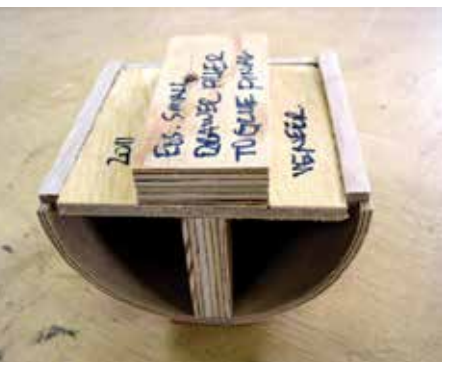
This drawer sizing jig may appear crude but it's an essential part of the build process

As with all drawers, a bit of cutting and final fitting is required. The drawer must first be fit without a front to determine its size in relation to the drawer and the housing. Create a simple T-jig that fits inside the drawer to ensure that the drawer sides sit square and parallel. The jig is far better than a drawer front because it allows you to see