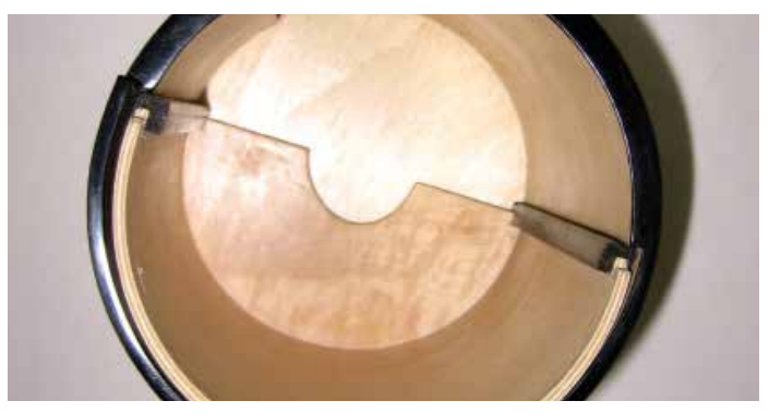
Use off-cuts from the drawer to locate the position of the drawer box within the housing

The drawer assembly is ready for the final mounting on the cabinet. Spread a small amount of glue in the dados on the drawer support and on the tongue for the housing and slide the assembly on the cabinet for the last time. You may drive a screw through the back on the housing into the cabinet support for added strength. I'm excited about the unlimited creative possibilities that round drawers offer and I'm eager to see other furniture makers experiment with the concept.