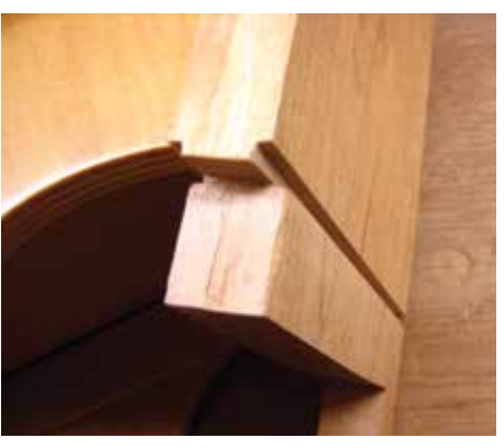
Grooves in the drawer support are used to locate the drawer housing

in full view. If the housing was made too small earlier, you can recover here by sizing the back to make the housing slightly larger. Test fit the drawer again with the housing back in place. Glue the back on the housing.