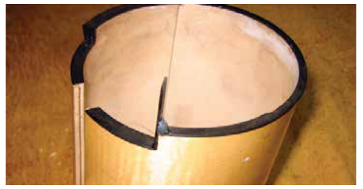
Hot glue is the perfect third hand when conventional clamps don't work

Now all that remains is to hide the plywood look on the front of the laminated housing. Cut small, thin trim pieces to cover the exposed end of the lamination leaving excess overhang to be trimmed flush after the glue has cured. Glue the trim in place with epoxy as an adhesive and hot glue as a clamp. Be sure to wax the prefinished housing and don't clean up epoxy that oozes because it will simply pop off when the decorative trim is cleaned flush with a fine file.