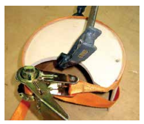
A strap clamp works nicely when gluing the round backs in place

of stock and cut a groove for the trim that mates with the lamination thickness. Fit and plane the inside edge of the decorative trim now – it is difficult to work this edge once it is on the drawer. Cut the trim away from the larger piece of wood and leave excess material to the outside edge of the trim. Cut the trim to length leaving a tongue at the front of the drawer to attach the drawer front. Glue the trim in place using a jig as shown. Once the glue has cured, the decorative trim can be planed to a more delicate dimension.