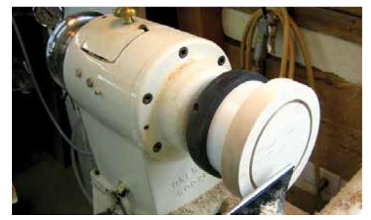
While you've got the drawer front on the lathe, cut the groove for the drawer box

It is now time to create the pocket for the drawer using its cutoffs. These cut-offs serve two purposes when glued in place. The upper edges of the cut-offs create rebates where the housing sits in the drawer support dados, while the lower edges of the cut-off pieces create a pocket for the drawer. With the housing and drawer mounted on the cabinet, measure and trim the cut-offs to size. Test fit the drawer again with the cut-offs clamped in place. When gluing the cut-offs in place leave the housing and drawer mounted on the cabinet as a jig to position the pieces. Wax the drawer and the inside of the housing to control glue squeeze out. Glue the cut-offs in place.