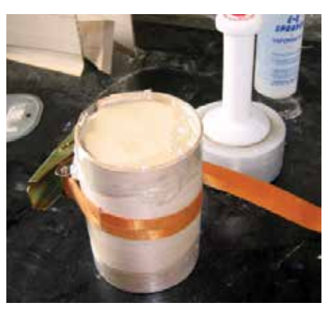
Use whatever means you have at your disposal to hold the veneers onto the former before it goes into the vacuum bag

To create the laminations, the veneer sheets are cross-oriented for stability and strength. The easiest way to spread the glue on the veneer is to make a veneer and glue sandwich, one sheet at a time. Select a glue with a long open time and apply to the first piece of veneer with a fine notched spreader or roller and place the next cross banded piece on top of the glue surface. Spread glue on the second sheet, while it is on the sandwich, and repeat the process with the remaining sheets, topping off the lamination with the last dry sheet. Aesthetically you may find it preferable to use an odd number of layers in the sandwich so the grain direction on the inside of the component matches that of the outside. Depending on the radius of your cylinder, timbers with an open grain