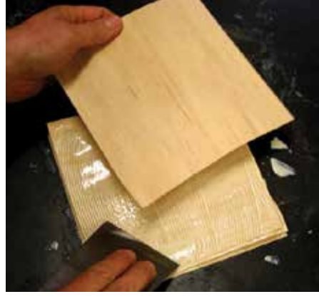
Layer the veneers on top of each other in a sandwich as you work

Sizing the veneer sheets for the drawer parts is important. The laminations must wrap around the former in as close to a full 360° wrap as possible, without the ends of the laminations overlapping. Don't forget the veneer will expand when it comes into contact with glue so take this into account