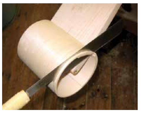
Trimming the housing to length while it hangs on the drawer support